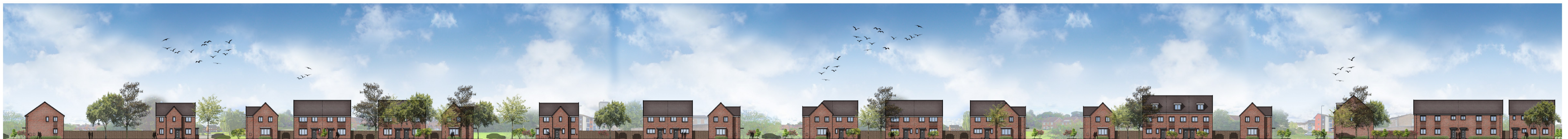
Proposed Streetscape 'C-C' to Henley Road