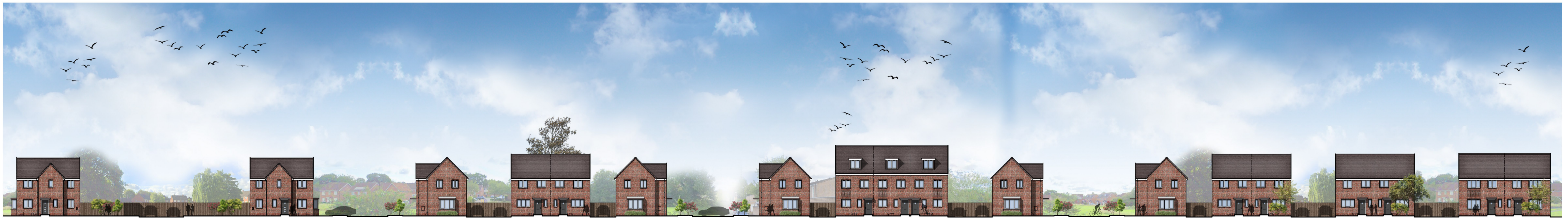
Proposed Streetscape 'B-B' to Ellacombe Road