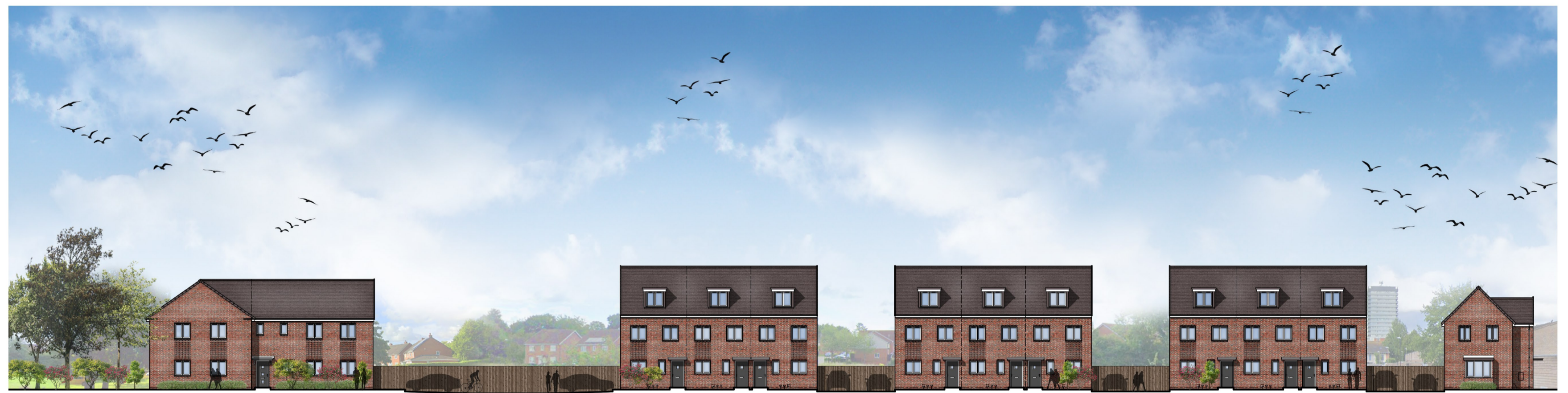
Proposed Streetscape 'A-A' to Broad Park Road