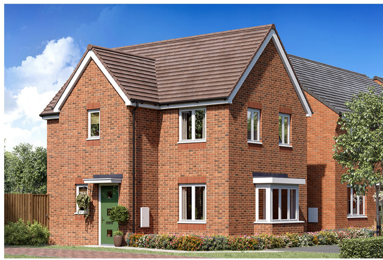
The Weaver (3-Bed dual aspect house for corner plots)