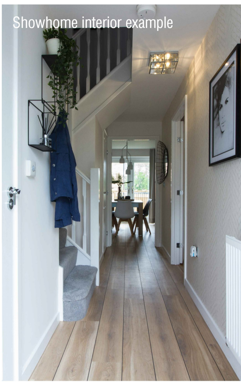
Showhome interior example