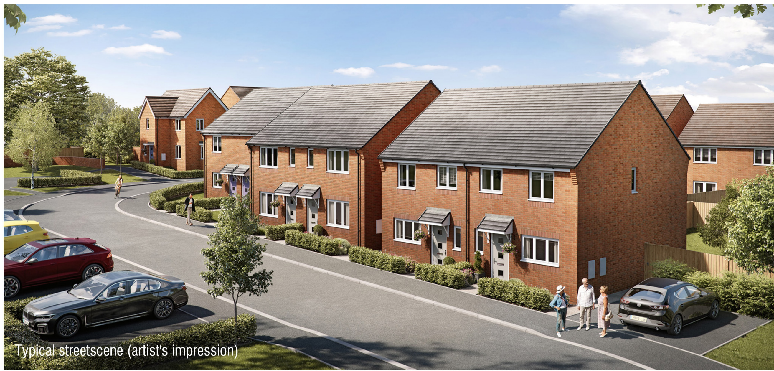
Typical streetscene (artist's impression)